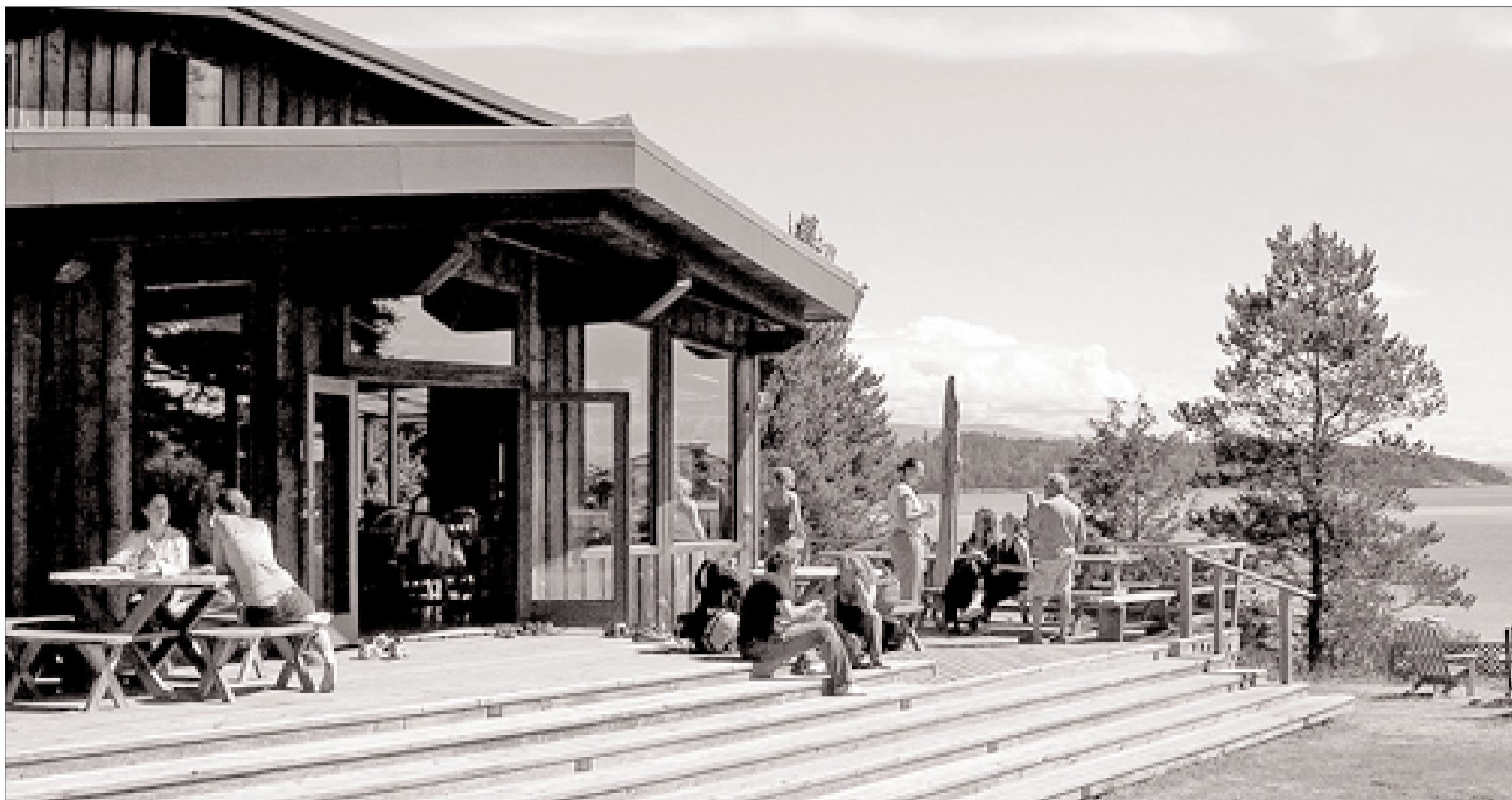
JOHN DE VAULT

Born a quarter century ago from the ashes of Cold Mountain, a gestalt centre, Hollyhock aims at helping visitors integrate their lives with nature, spirit and creativity.